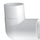
SP x FPT