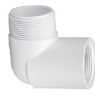
MPT x FPT