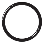
Buna-N (Nitrile) (Current style)