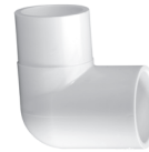
SP x Slip