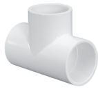
Slip x Slip x Slip