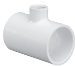
Slip x Slip x Slip