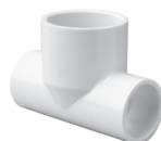
Slip x Slip x Slip