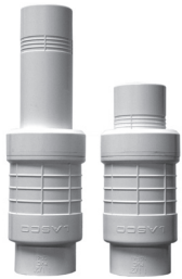
Slip x Spigot