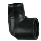
MPT x FPT (Poly Version)