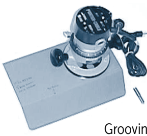
Grooving Jig with Router