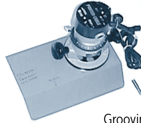
Grooving Jig with Router