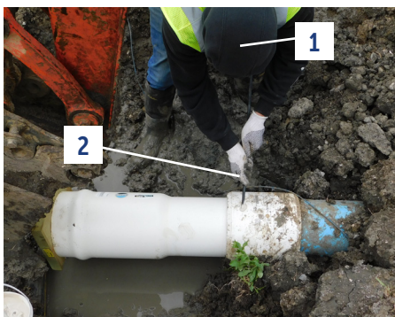
Site 1: One laborer, as little as two parts