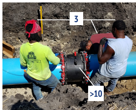
Site 2: Traditional iron restraint joint requires three laborers and at least ten parts