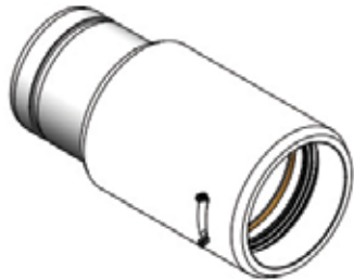
Certa-Lok/IB Male x Certa-Lok CLIC Female Well Casing Adapter