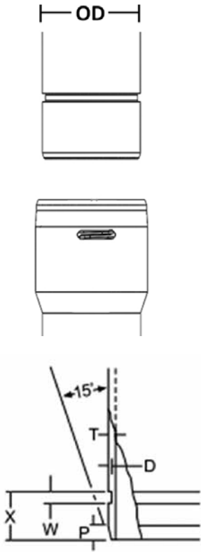
Certa-Lok® CLIC™ Dimensions